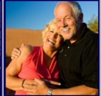
Life & Health